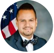
José M. Serrano